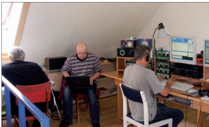
14 CW team