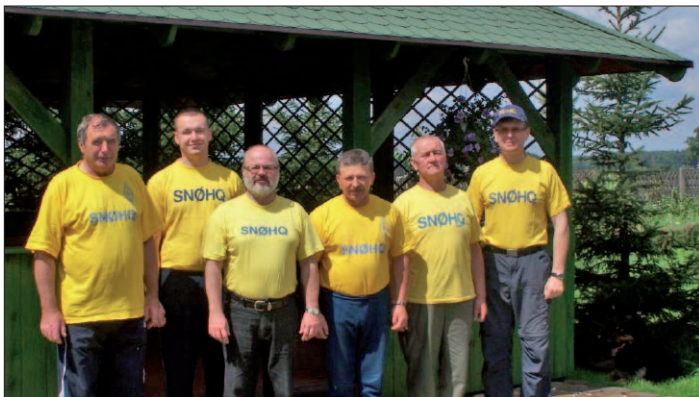
3-5MHz SSB team