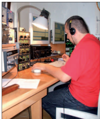
14 CW team