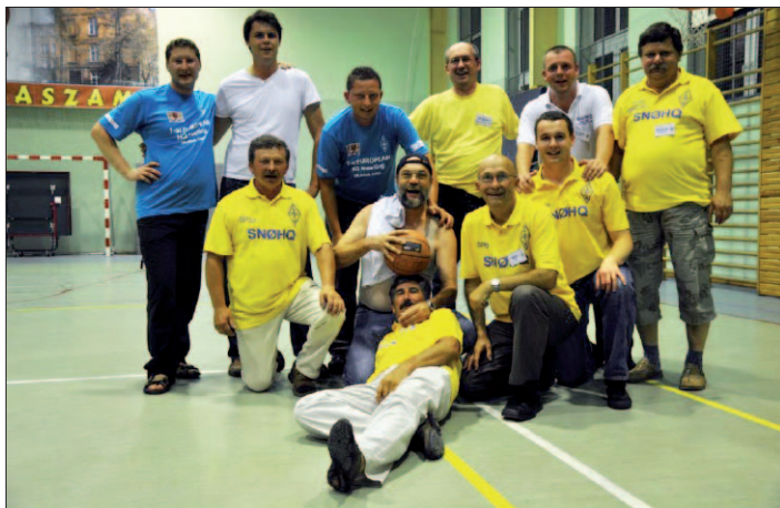
EU HQ Basketball team

average from 1 to 5 transceivers on each station. All transceivers on each location are connected to a local network. Each station is further connected to other stations via internet.