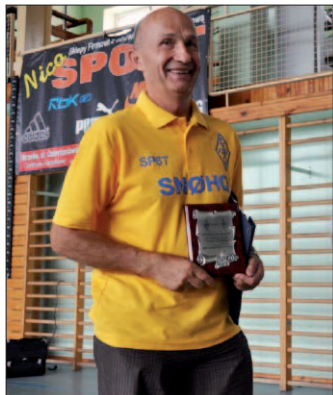
Graverton from DARC