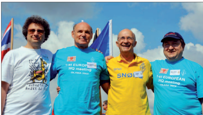
GB, YO, SP, DL – Captains