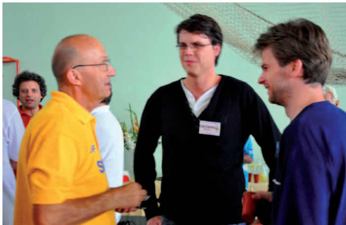
Discussion OK – SP