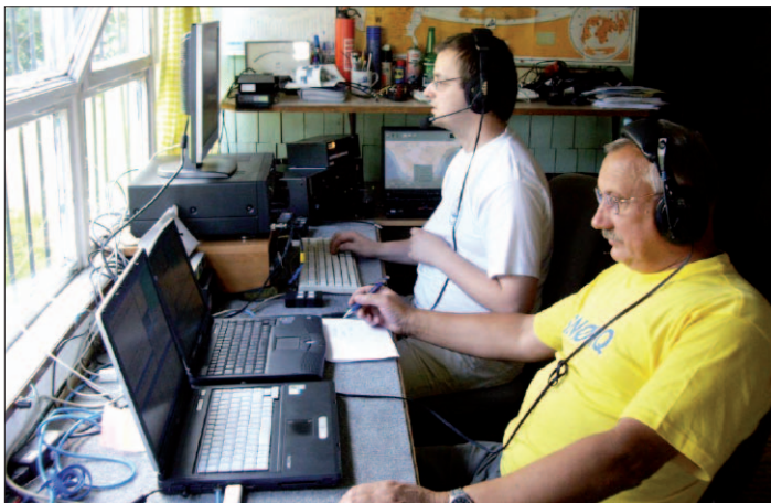
7 MHz SSB team