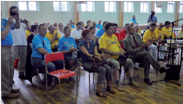
The local authorities

All equipment we use is our private property. We have on