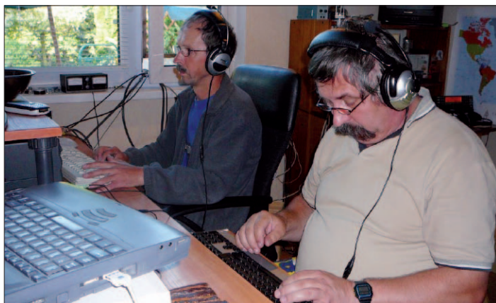
7 MHz CW team