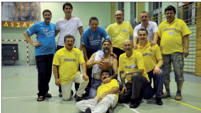
EU HQ Basketball team

For the AO8HQ station each QSO with the zone 28 gives 5 points. In 2009 36.6% participants were from the zone 28!!! The zone 36 is out of statistics with less than 1% of participants.