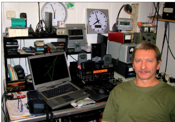
SN0HQ webmaster SP5ELA