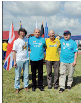
GB, YO, SP, DL Captains