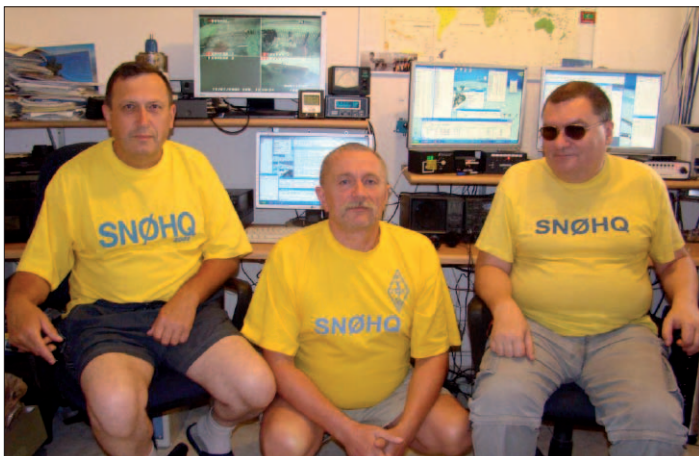
28 MHz CW team

Number of qso's: SNØHQ (~20000) 2'd place, AO8HQ (~12000) 10'th place,