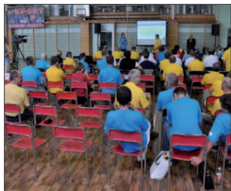
1,st EU HQ Meeting is open

participants from different countries. Thus we had colleagues from DL, G, OK, YO and SP. We discussed about teams organisation, licences, tactics, equipment, software and about proposals for changes in the IARU rules.