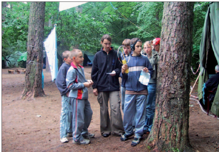
ARDF training at a PZK training camp

The 24 th February 1930 is regarded as the official date of the founding of the PZK. There were four founder members: the radio clubs in Lvov, Vilnius, Poznan and Warsaw. At that time, the problems that we had to deal with were si-