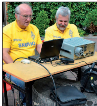
SP2JMR President of PZK visits event station HF6HQ