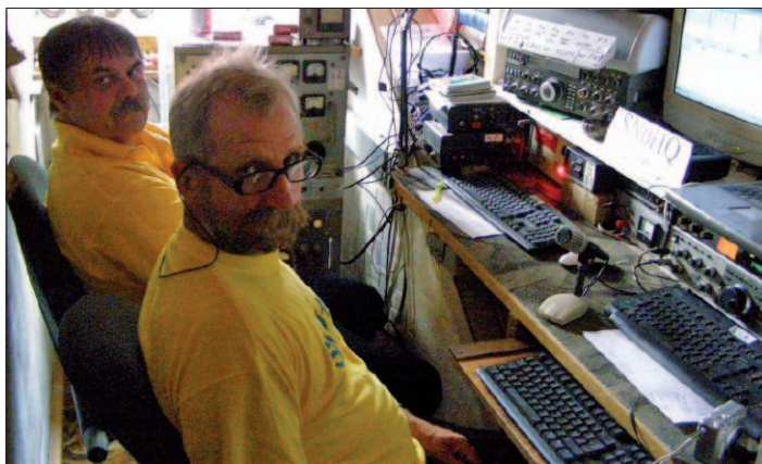
Low bands team